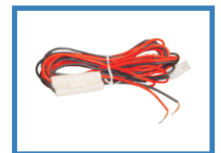
DC Power cable