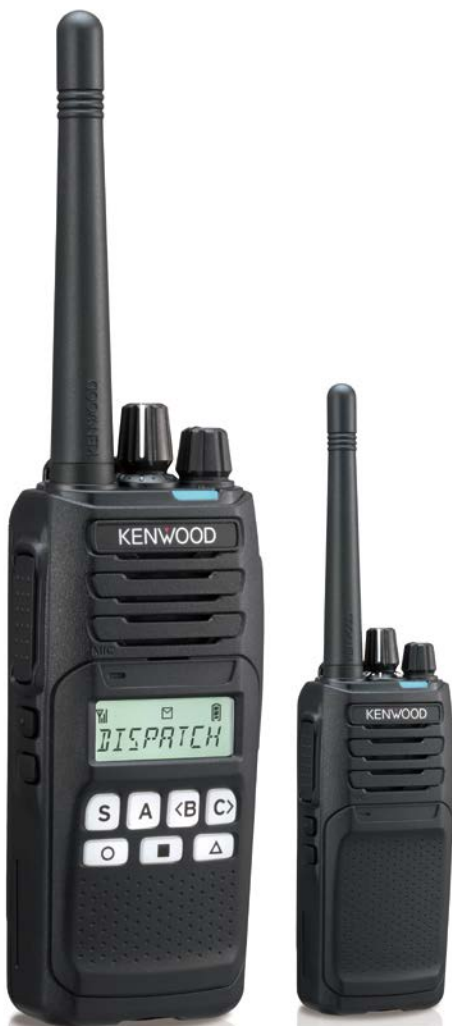
Standard Keypad model